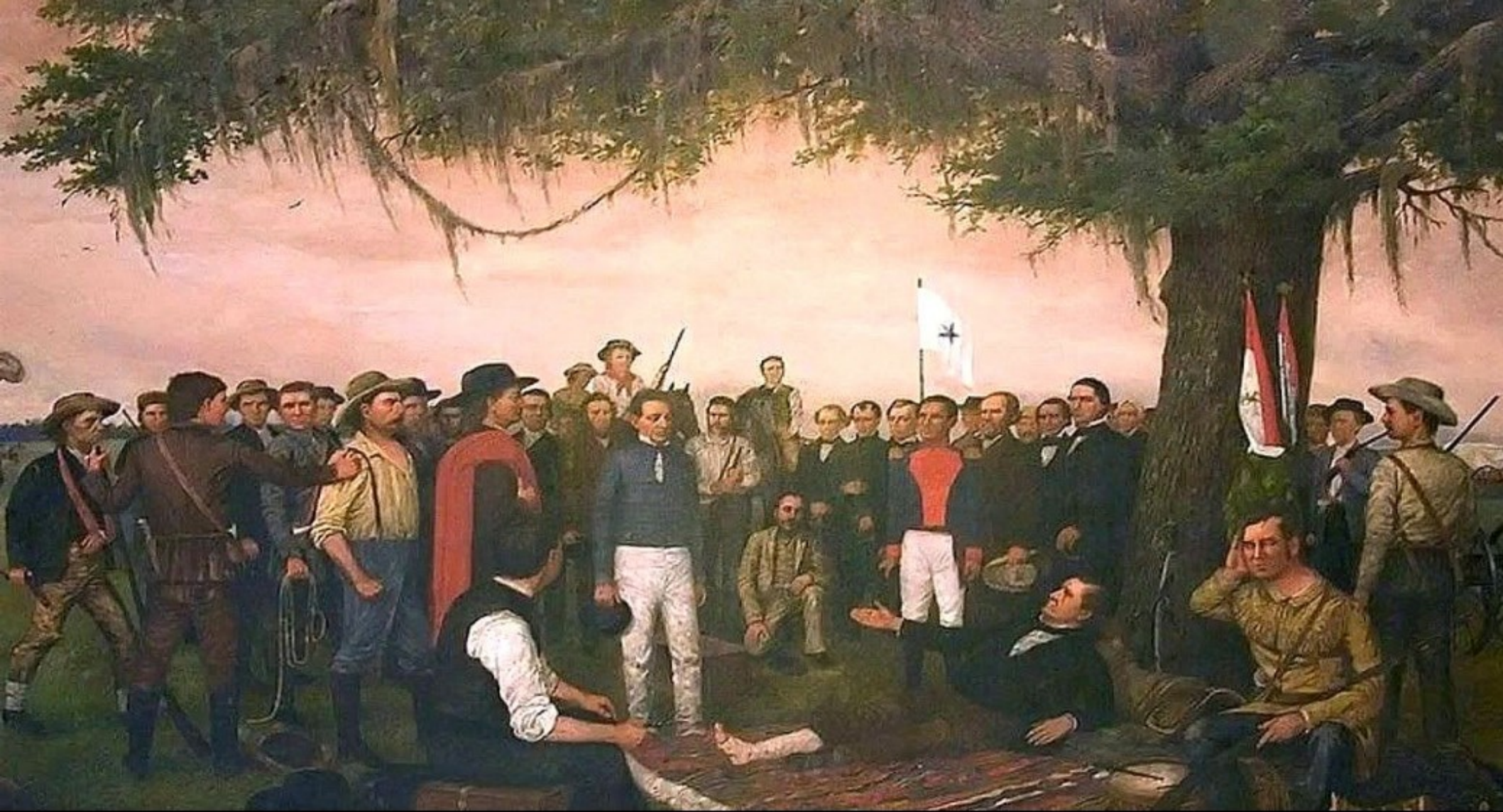
The Surrender of Santa Anna by William Henry Huddle, 1886